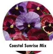
Coastal Sunrise Mix