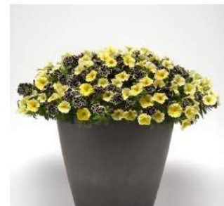
“Oh Beehave” (bees knees petunias and midnight gold petunias)