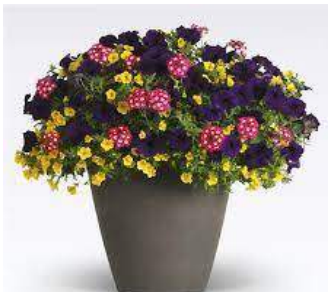
“Over the Top 23” (cabaret yellow calibrachoa, cannonball blue petunia and wink burgundy verbena)