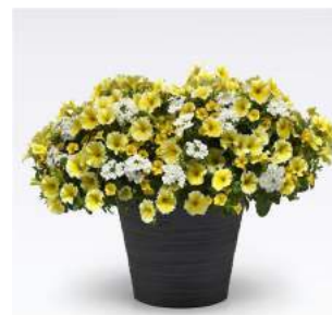
“Sunnyside Improved” (petunia bee’s knees, calibrachoa cabaret yellow and verbena firehouse white)