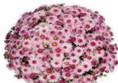
Lively Pink Bicolor