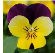
“Yellow Jump Up”