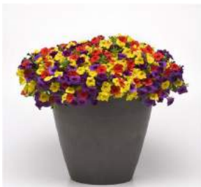
“Conga Line” (calibrachoa conga dark blue, calibrachoa conga red and calibrachoa conga yellow)