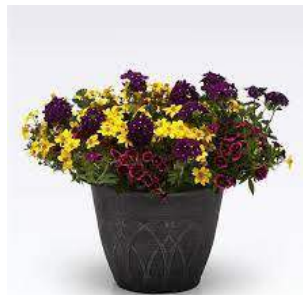
“Kiss Me Goodnight” (sundrop bidens, cabaret good night kiss calibrachoa and verbena firehouse purple)