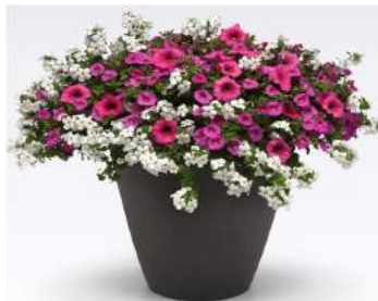
“Rose Everyday” (calibrachoa cabaret pink, cannonball pink petunia and bacopa megacopa white)