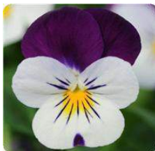
“White Jump Up”