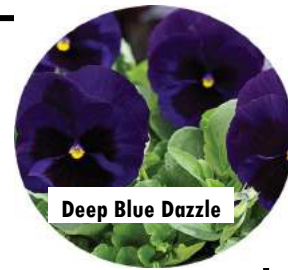
Deep Blue Dazzle