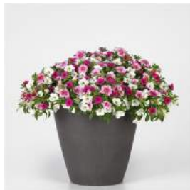
“Serendipity” (calibrachoa cabaret bright white, calibrachoa cabaret neon rose and calibrachoa strawberry parfait)