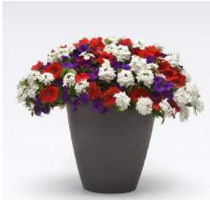
“Bloomin’ Glory” (calibrachoa cabaret midnight blue, petunia cannonball red and verbena firehouse white)