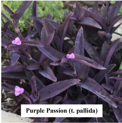
Purple Passion ( t. pallida )