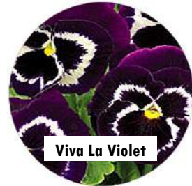
Viva La Violet