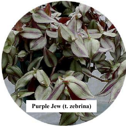
Purple Jew ( t. zebrina )