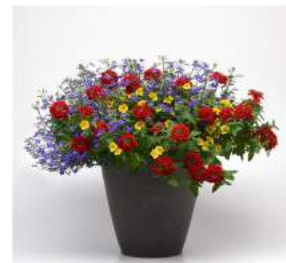
“Color Magic” (calibrachoa cabaret yellow, lobelia early springs dark blue, and verbena firehouse red)