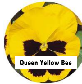
Queen Yellow Bee