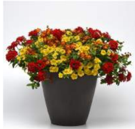
“Biden My Time” (biden bee happy red, calibrachoa cabaret yellow and verbena firehouse red)