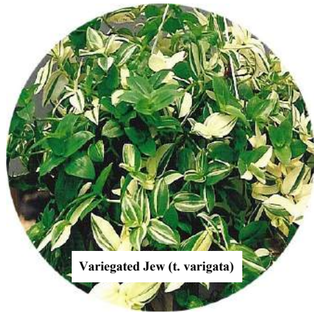
Variegated Jew ( t. variegata )