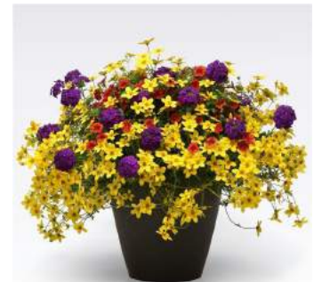
“Santa Fe Sunset” (sundrop bidens, cabaret orange calibrachoa and firehouse purple verbena)